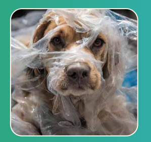
Pets vs. Plastics