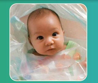
Babies vs. Plastics